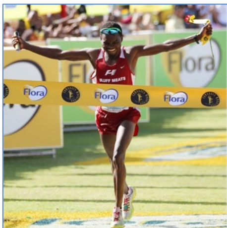
Comrades Ultra Marathon

The South African Children's Project offers exciting ways to earn a trip to Indawo Yethemba Children's Village in South Africa while raising funds for the project. If you are a marathon runner or a long-distance cyclist, you can earn a round-trip ticket to visit the Graham family and the grannies and children