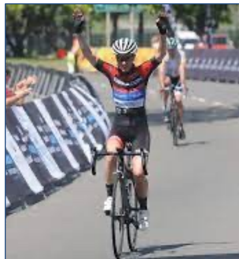
Amashova Durban Classic