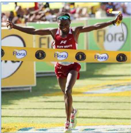
Comrades Ultra Marathon

The South African Children's Project offers exciting ways to earn a trip to Indawo Yethemba Children's Village in South Africa while raising funds for the project. If you are a marathon runner or a long-distance cyclist, you can earn a round-trip ticket to visit the Graham family and the grannies and children