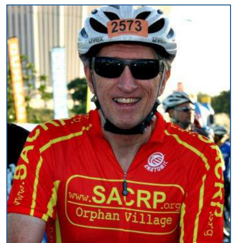
Amashova Durban Classic