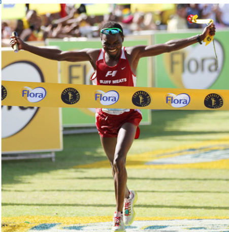
Comrades Ultra Marathon