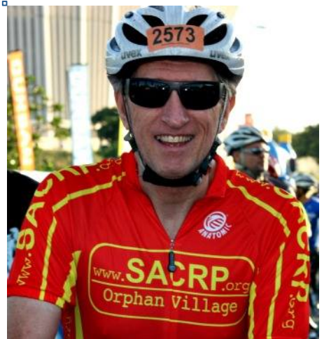
Amashova Durban Classic