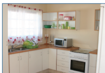
Typical Village Kitchen

approved. Some may think that because the children's village is located in a developing country like South Africa, building would be relatively simple and inexpensive. Well, all the usual things such as building permits, site inspections and such are required. Currently our architect Jan Kirtzinger is busy submitting plans for the new building projects. This phase should complete the infrastructure for the village.