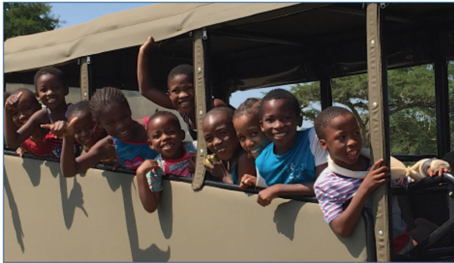
Safari Time During School Holiday

Indawo Yethemba Children's Village is unique in its approach to orphan care. With help from local churches, we find Christian caregivers who wish to foster children. We then empower these caregivers to raise abandoned and orphaned children in an environment that is safe. Though project is not perfect, it appears