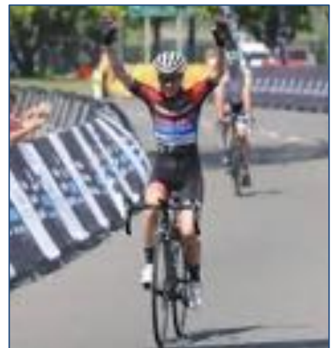
Amashova Durban Classic