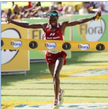
Comrades Ultra Marathon