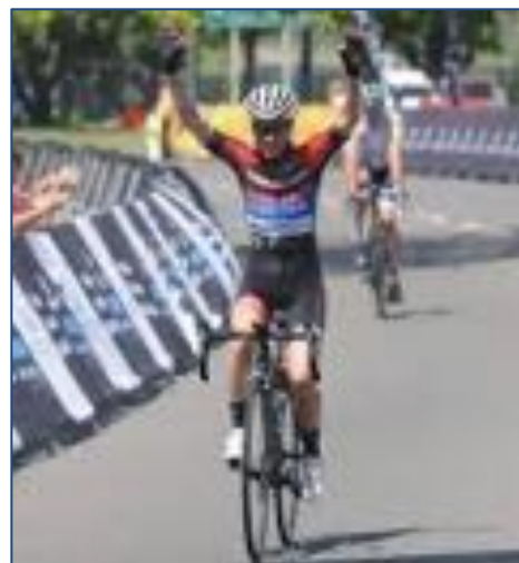
Amashova Durban Classic