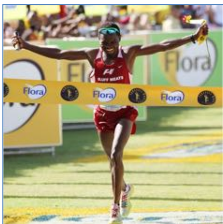
Comrades Ultra Marathon