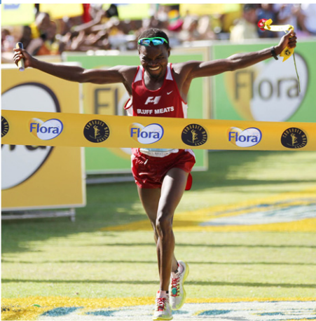
Comrades Ultra Marathon