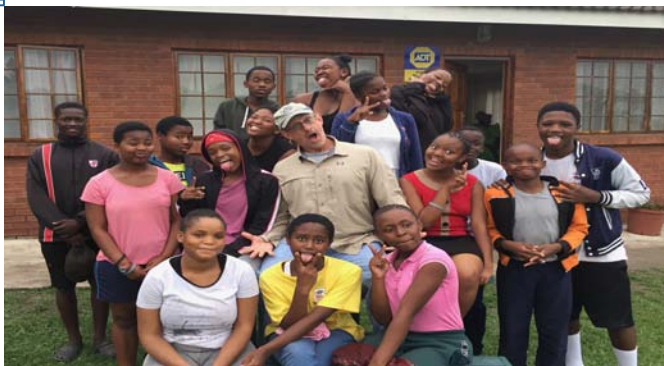
The Teens of Indawo Yethemba