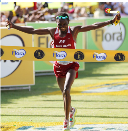
Comrades Ultra Marathon