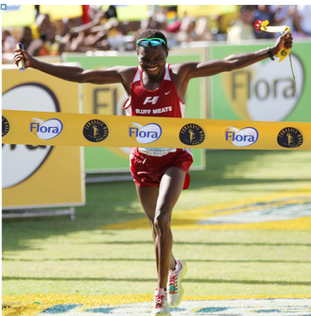
Comrades Ultra Marathon