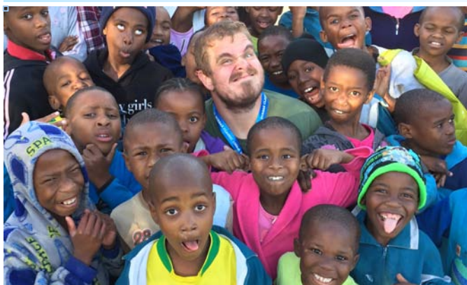
Safari Time During School Holiday

As most of you are aware, our busiest time of the year is between April and October. This year was no exception. We have hosted over 50 people from the states, including mission teams, university students, and