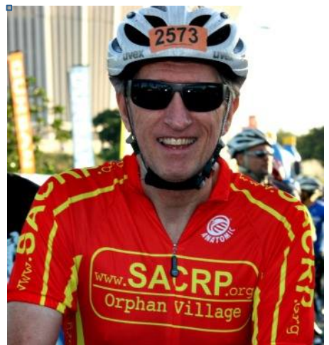
Amashova Durban Classic