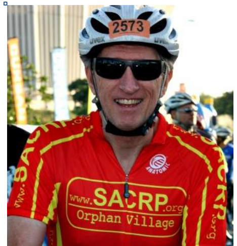
Amashova Durban Classic