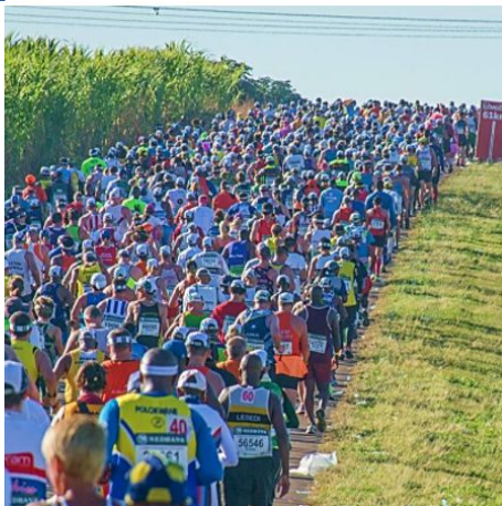
Comrades Ultra Marathon

The South African Children's Project offers exciting ways to earn a trip to Indawo Yethemba Children's Village in South Africa while raising funds for the project. If you are a marathon runner or a long-distance cyclist, you can earn a round-trip ticket to visit the Graham family and the grannies and children