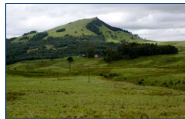
Bulwer Farm Possible 2 nd Children's Village