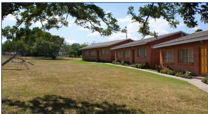
New Homes Planned for 2012