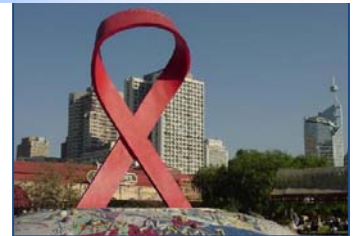
AIDS Memorial, Durban

CAPETOWN – Health Minister Aaron Motsoaledi unveiled what he calls shocking figures showing a huge AIDS-related leap in South Africa's death rate. "[From 1997-2008], the rate of death has doubled in South Africa." Motsoaledi pins the blame for the current scale of the pandemic on denialist policies pursued by former president Thabo Mbeki's government. He said that in 2007, the total number of registered deaths in South Africa was 573,408; in 2008, this figured leaped to 756,062. Shocking because this figure was just over 300,000 in 1997, over 100% increase. Researchers attribute rise to the AIDS pandemic. They believe such a change in the death rate to be a better indicator of the spread of AIDS than merely absolute HIV figures because most HIV-related deaths are misclassified. The worst –