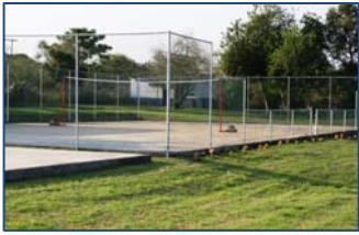
New Tennis Fence

Though the children's village does not have funds to add any new major projects, it has been able to complete two that were started earlier this year. Money was donated to finish both the