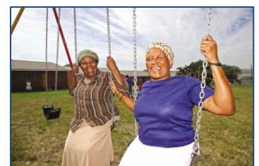
"Grannies to the Rescue"