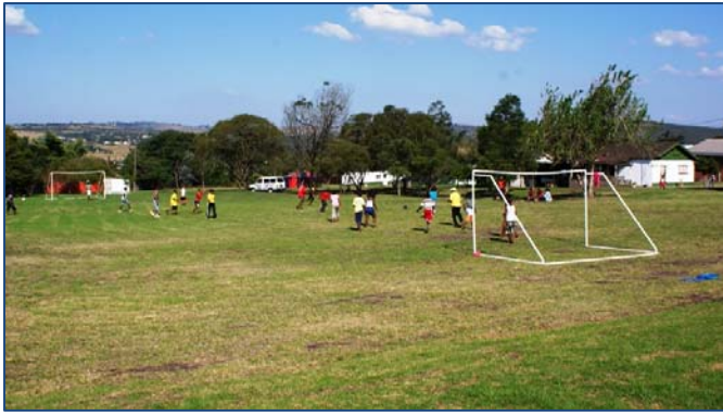
Children Enjoy New Soccer Field

camps. The first camp took place in March with over 25 kids from Durban attending. The second camp took place at the end of April with 44 kids attending. It was the first time that most of these kids had ever attended a church camp. The main reason that these children