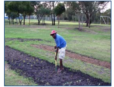
Vuyane Begins Veggie Project

The last phase of Indawo's growth is the addition of its first vegetable garden and fruit trees. The property will have 56 gardens, each with a different crop. Each garden will be approximately 350 square feet. Currently, two have been cultivated with broccoli, beats, spinach and cabbage. In addition, two orange, two lemon and two tangerine trees have been planted. Because the climate is similar to that of California or Florida, crops do well. Within the next few weeks, the village plans to add a rooster and six hens. Later it will add broiler chickens, which will be used for meat. These achievements will aid in the overall goal of helping