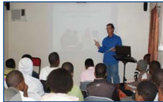
Session 4: Reaching Friends for Christ

tennis fence and the children's dormitory. The village can now house about 50 kids for youth camps. It can also house about 30 adults for church retreats. It still needs about $300 to