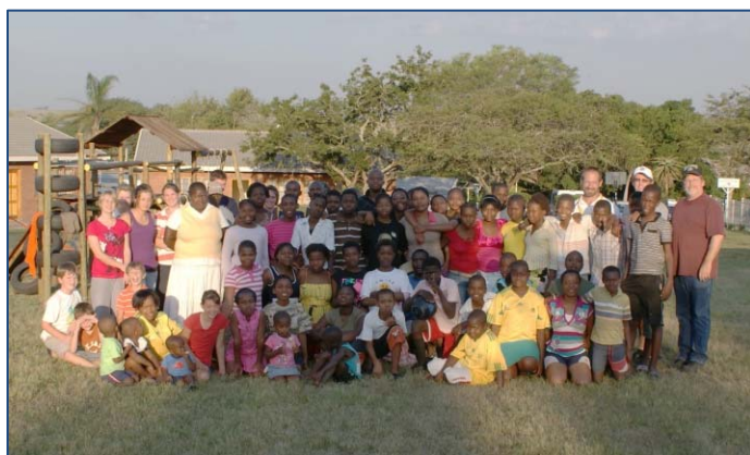
Indawo Yethemba Youth Camp

Don't judge each day by the harvest you reap, but by the seeds you plant.