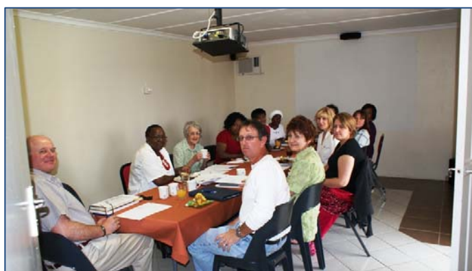
Msunduzi Children's Forum

City's Children's Forum Visits to See Expansion