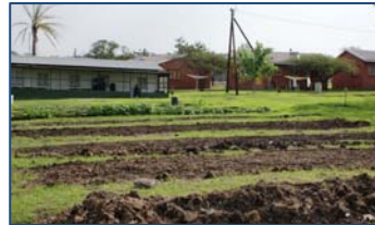
Irrigation System Needed

three already. Finally, we need to raise about $3500 to begin our irrigation system, which includes a shallow well, pump and sprinkler system. Again, volunteers will install system – fresh veggies for all.