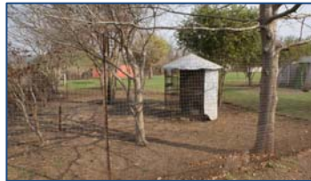
New Chicken Pen

is about $400. Volunteers will be able to replace it. Also, chicken pen is now being used – fresh eggs; however, dogs have been a problem: they seem to love chicken. They have killed