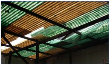
Barn Roof Repair Needed

Currently, the children's village is working on a few minor projects as it waits funding for additional houses. First, because of heavy storms, the barn roof needs repair. Material cost