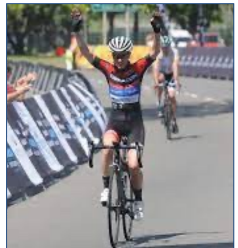
Amashova Durban Classic