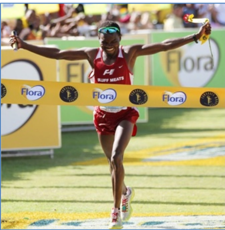
Comrades Ultra Marathon

The South African Children's Project offers exciting ways to earn a trip to Indawo Yethemba Children's Village in South Africa while raising funds for the project. If you are a marathon runner or a long-distance cyclist, you can earn a round-trip ticket to visit the Graham family and the grannies and children