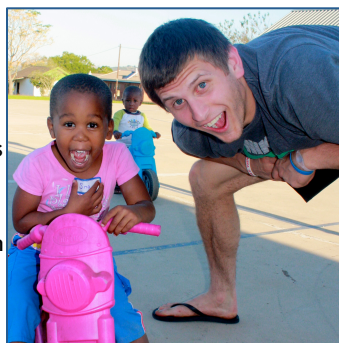
The Joys of Volunteering