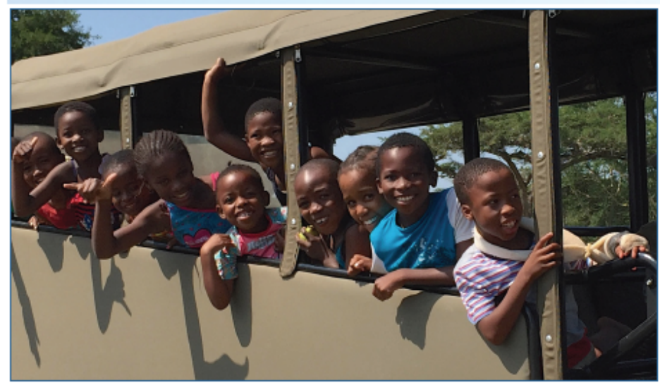
Safari Time During School Holiday

Indawo Yethemba Children's Village is unique in its approach to orphan care. With help from local churches, we find Christian caregivers who wish to foster children. We then empower these caregivers to raise abandoned and orphaned children in an environment that is safe. Though project is not perfect, it appears