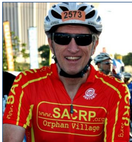
Amashova Durban Classic