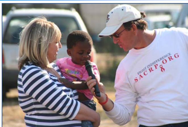
Tswarelo Says nGiyabonga

Do not pray for tasks equal to your powers. Pray for power equal to your tasks. Phillips Brooks