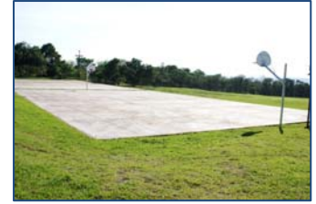
New Sports Courts

to complete tennis/volleyball court. Also, we are looking for anyone or organization interested in sponsoring one of our three remaining houses. Most importantly, we need more people to help us maintain our monthly budget which increases with each child we take. Currently, two of our kids require formal schooling; in addition, we expect about six new kids within the next two months. A few will surely need schooling.