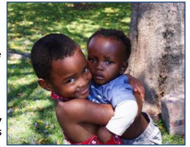
Busi Welcomes Her New Baby Brother

do. He somewhat agreed that it is possible to feed a child for $5 a month, but that it is impossible and foolish to believe that this amount has the power to increase the quality of life for anyone. The project is designed to provide all the necessary resources to ensure these children are successful in life. This amount can be quite expensive.